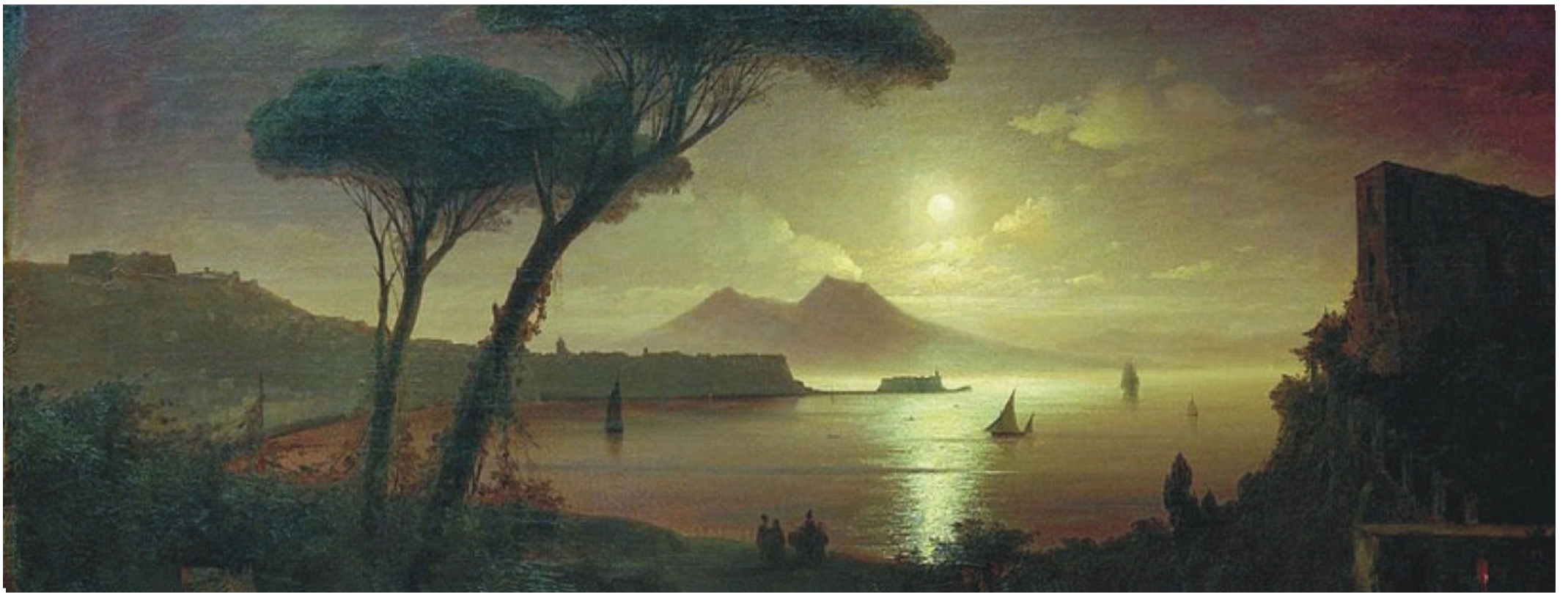
The Bay of Naples by Moonlight , by Ivan Aivazovsky, 1842, The Aivazovsky Art Gallery, Feodosia, Ukraine